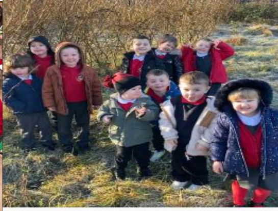
Pupils exploring and learning outdoors.