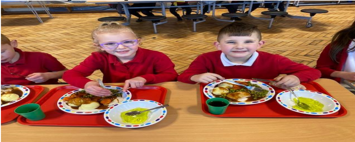
All our meals are cooked on site, we have fantastic cooks!

Application forms for 'free meals' are available at the school. Please contact the secretary for any further information on eligibility, as this may entitle you to access additional grant funding.