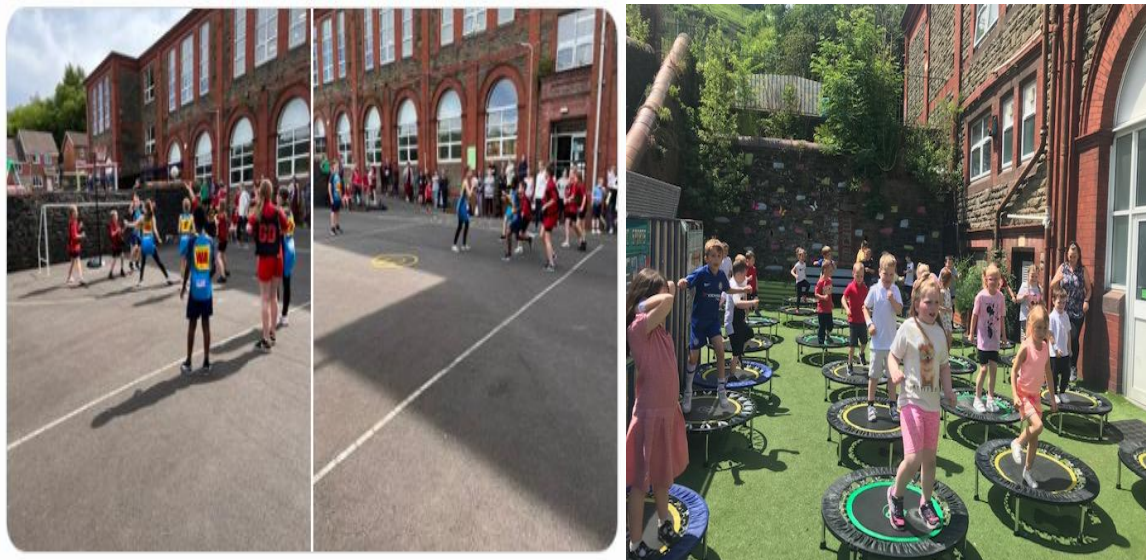
Keeping active and having fun is important to us all.