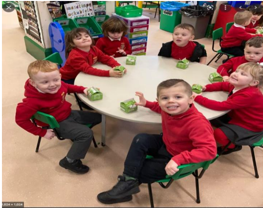
Foundation Phase pupils enjoying their daily milk time.