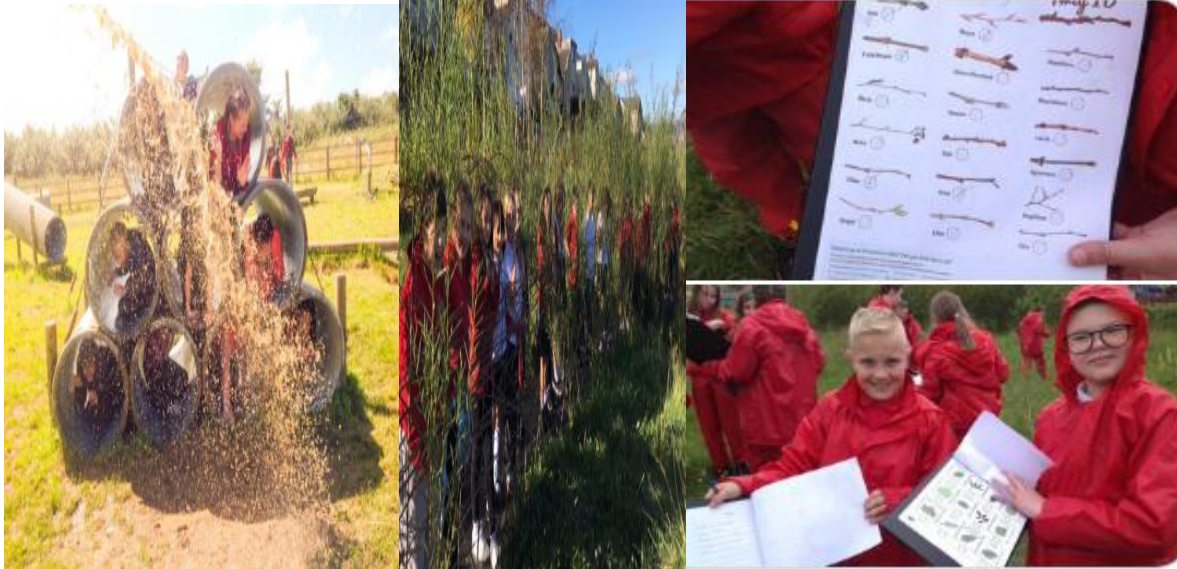
Outdoor and adventurous residential visit, activities and enhancing our environment with tree planting and outdoor learning.

* Please note we are an 'open door' school. If you have any concerns during the year you are asked to contact the Headteacher who is always available to discuss matters. Do not leave a problem grow!