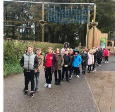
We learn from visits and visitors.