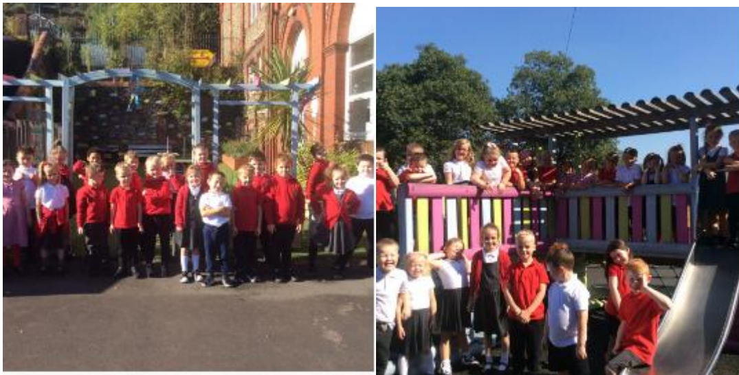
Pupils enjoy our Sports Yard, Play Yard and Quiet Yard as well as our Wellbeing Shed and our wild field.